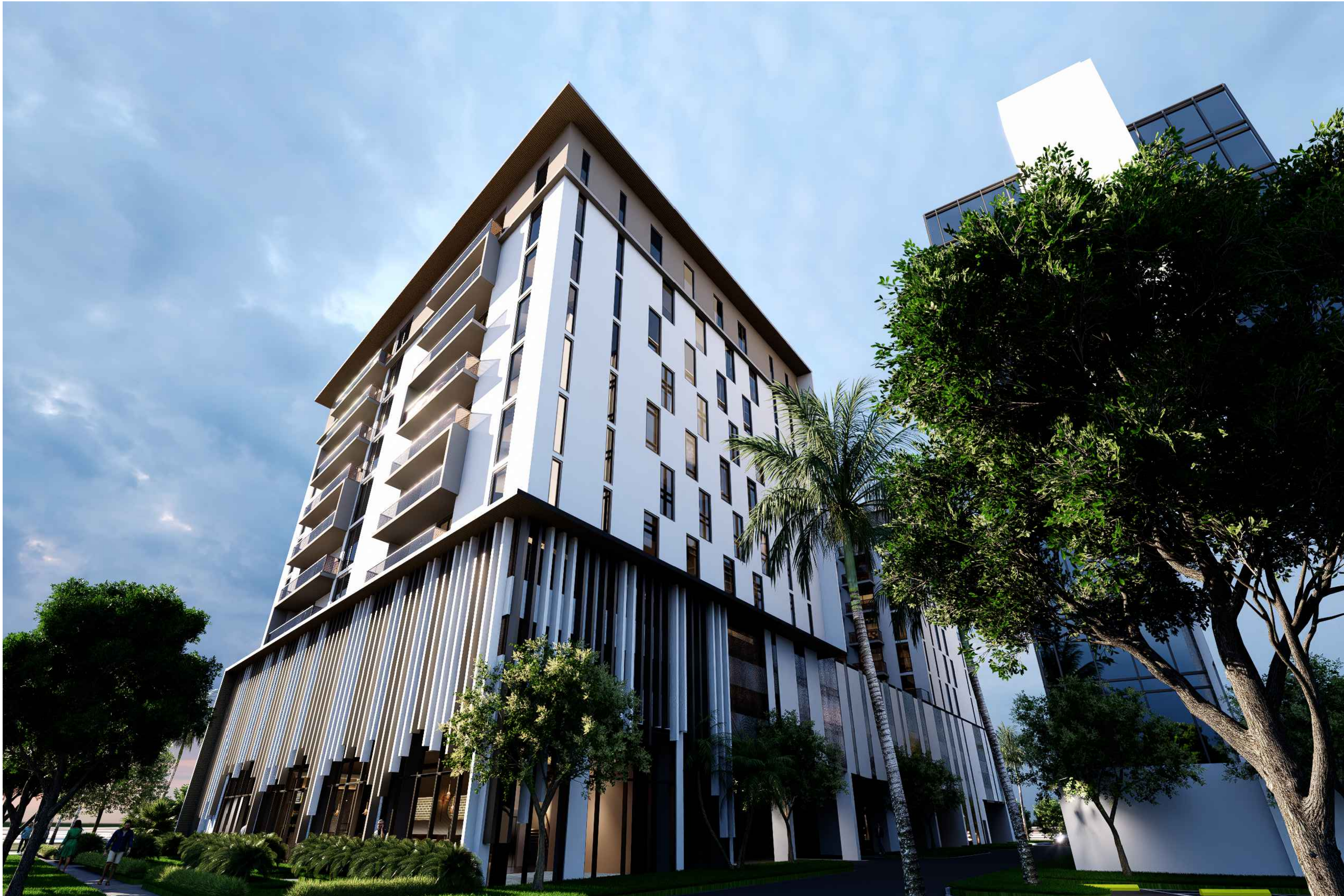
STREET VIEW OF THE SOUTH WEST CORNER OF THE BUILDING